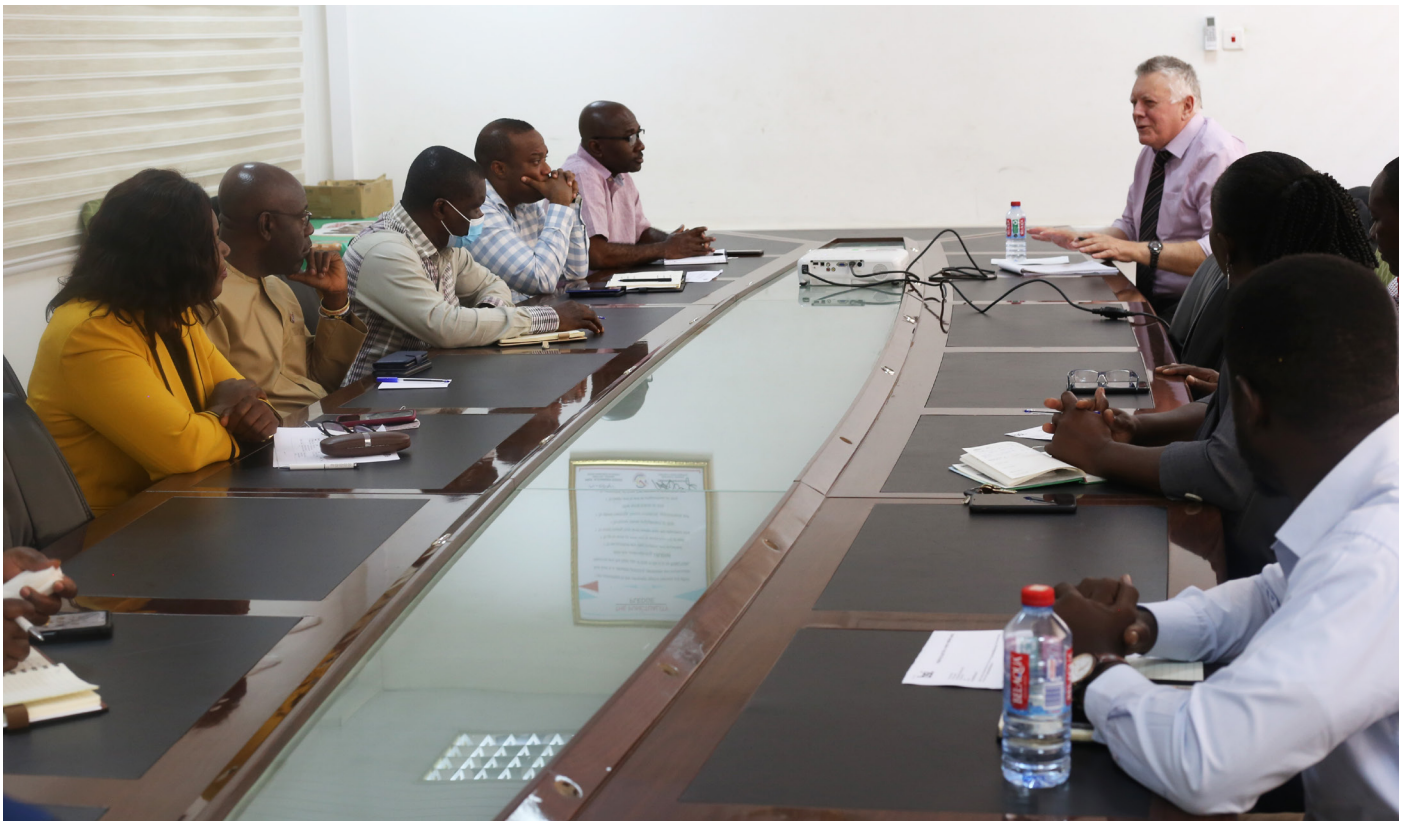
BSI’s Consultant addressing GSA management members during the meeting