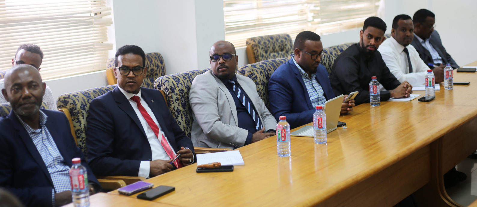
Somaliland Civil Service Delegation