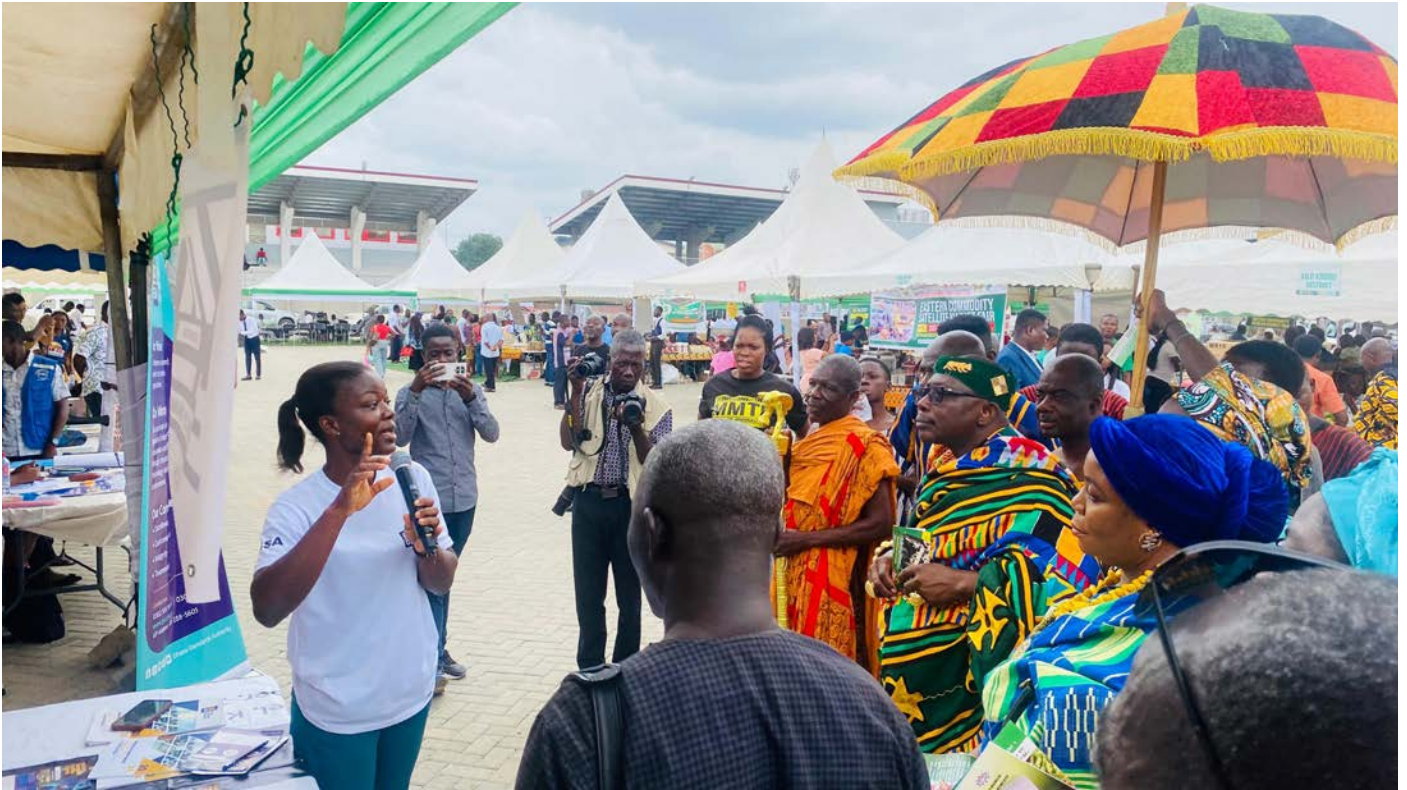
A GSA officer educating traditional leaders at the GSA stand

The Koforidua Office participated in the 5th edition of the Eastern Commodity Satellite Market Fair (ECSMF) at the Jackson Park. In Koforidua.