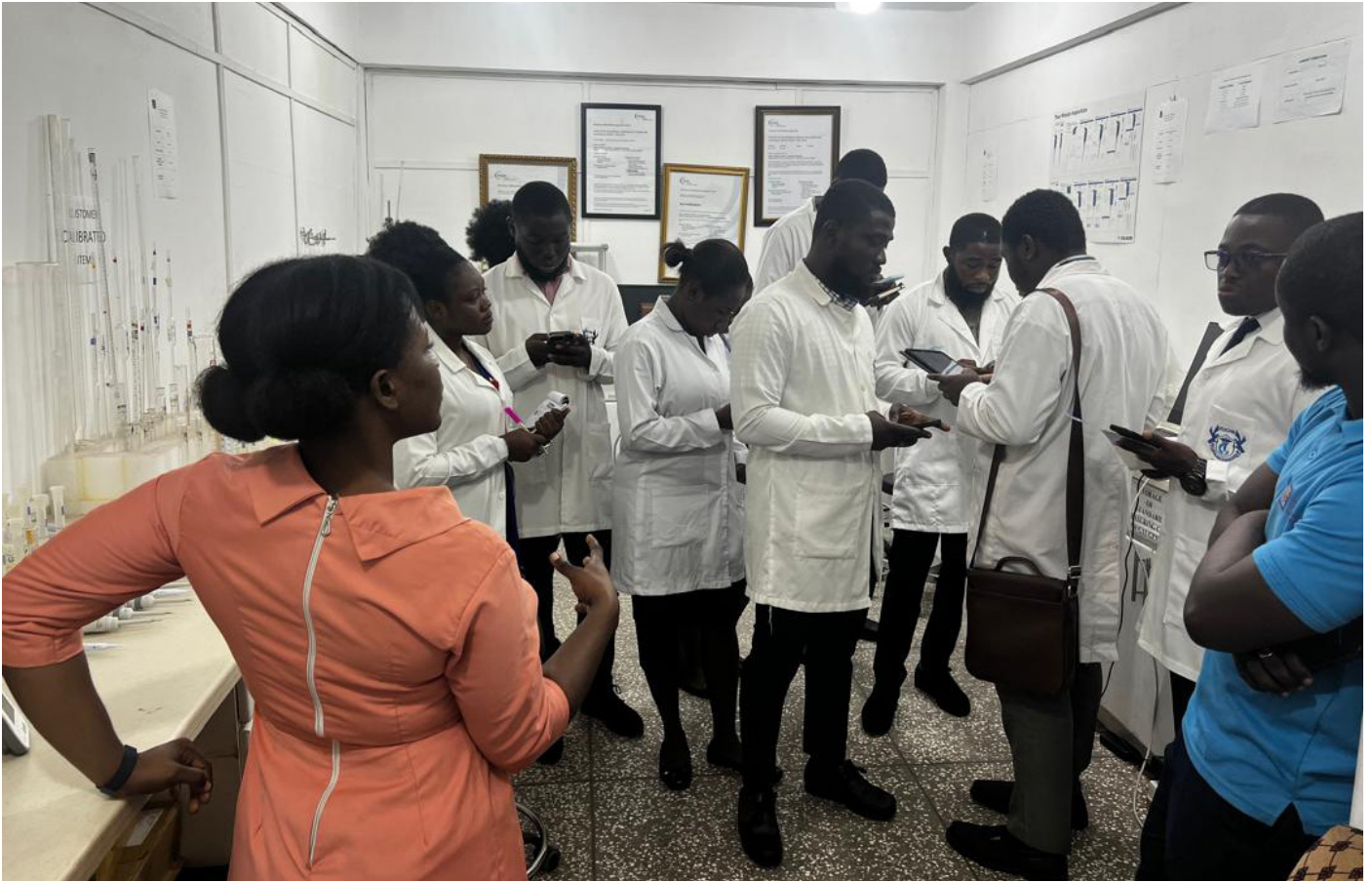
Entrance University students touring the volume lab

Fifth-year Pharmacy students from Entrance University, on Thursday, September 4, 2025, paid a visit to the GSA to learn about the operations of the Authority and the role the Authority plays in the field of pharmacy.