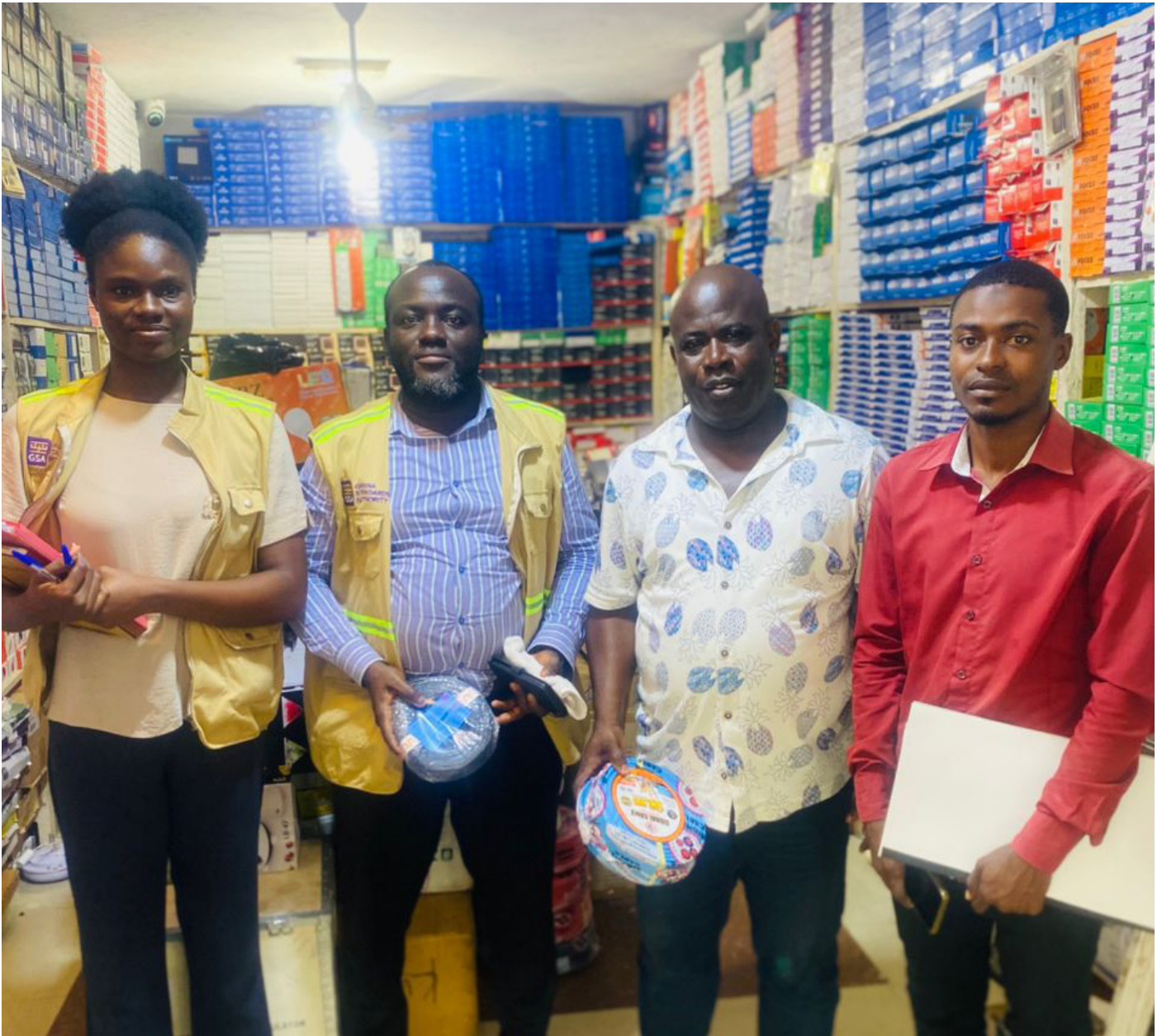
GSA Officers in a group photograph with an electrical wire trader

The Cape Coast Office, through its Trading Standards Inspectors (TSIs), embarked on a one-week exercise targeting traders of electrical wiring cables and accessories in the enclave.