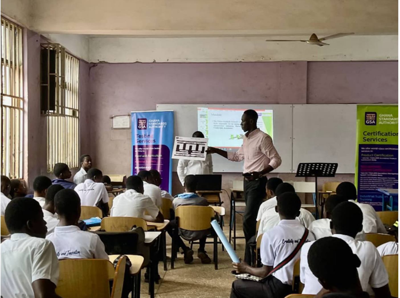
GSA officers educating the students

The Ashanti Regional office of the GSA, in collaboration with the Suame Technical Institute, organised a sensitisation programme for students and teachers of the school on the Authority's mandate and activities.