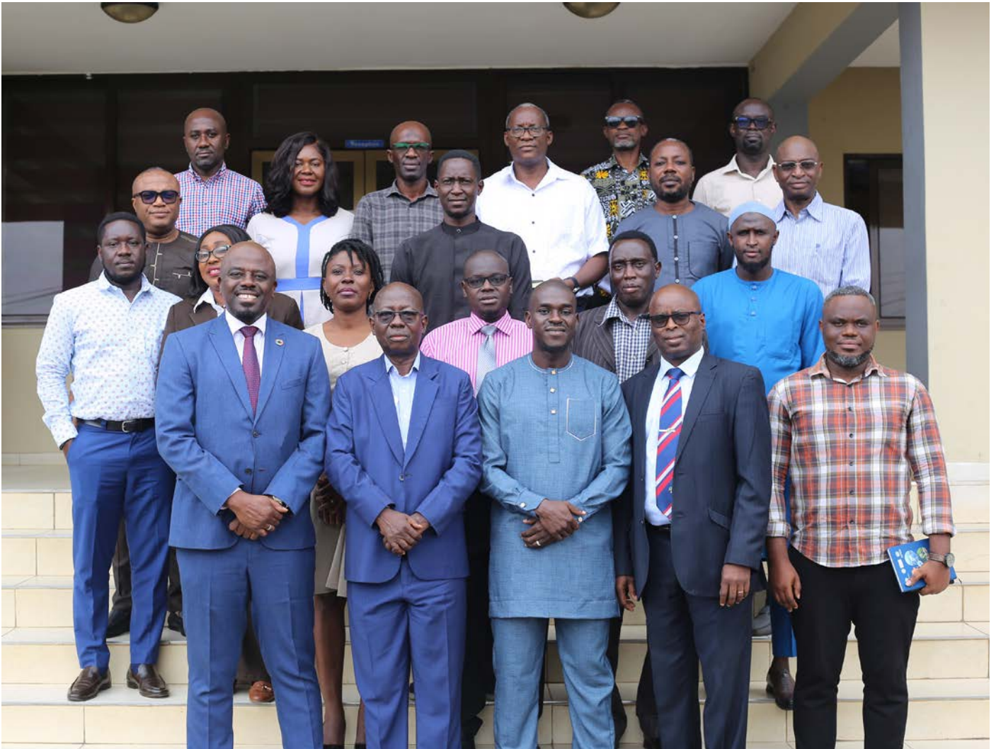
Group picture of the Gambian delegation and GSA officials

The GSA is currently hosting a delegation from The Gambia's Public Utilities Regulatory Authority (PURA) and the Gambia Standards Bureau (TGSB) who are in the country to undertake a study tour of the Authority.