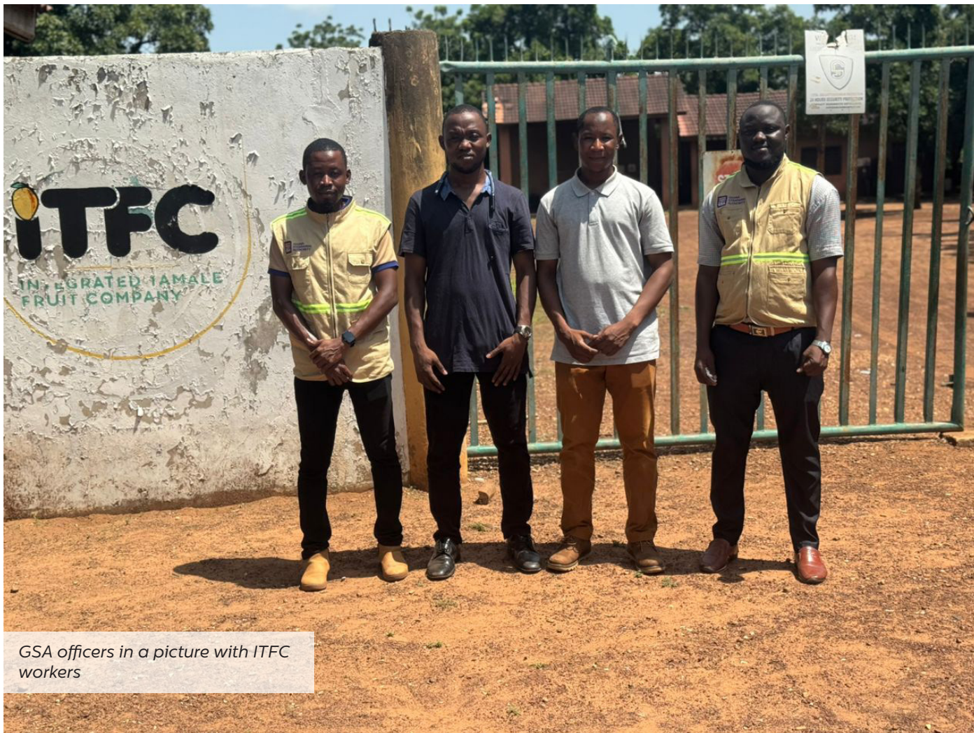
GSA officers in a picture with ITFC workers