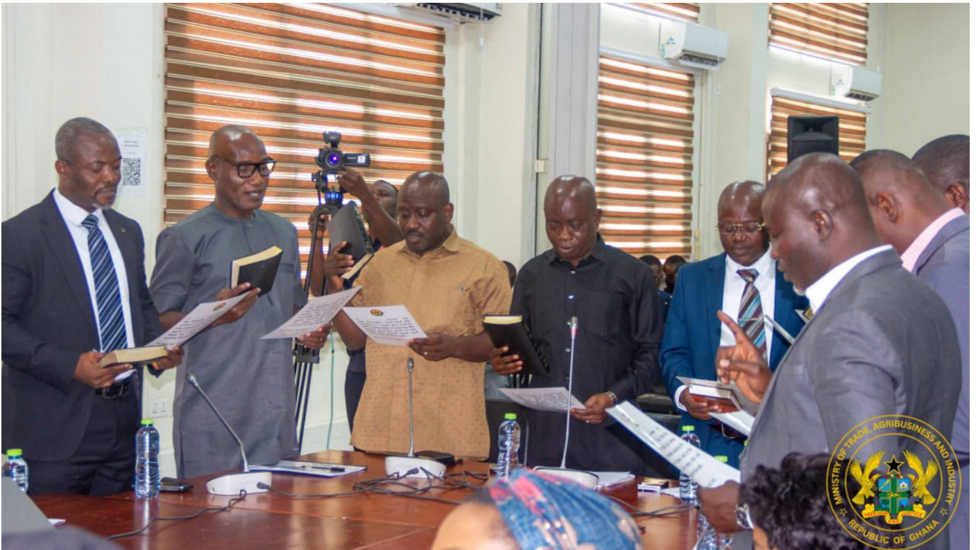
Deputy Trade Minister (middle) and other agency heads taking an oath