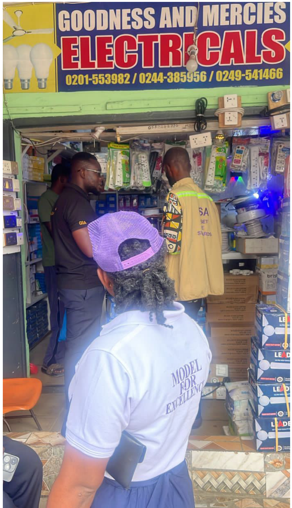
GSA officers engaging electrical cable dealers

Additionally, the sensitisation served as an opportunity to assess the reception of the programme by consumers