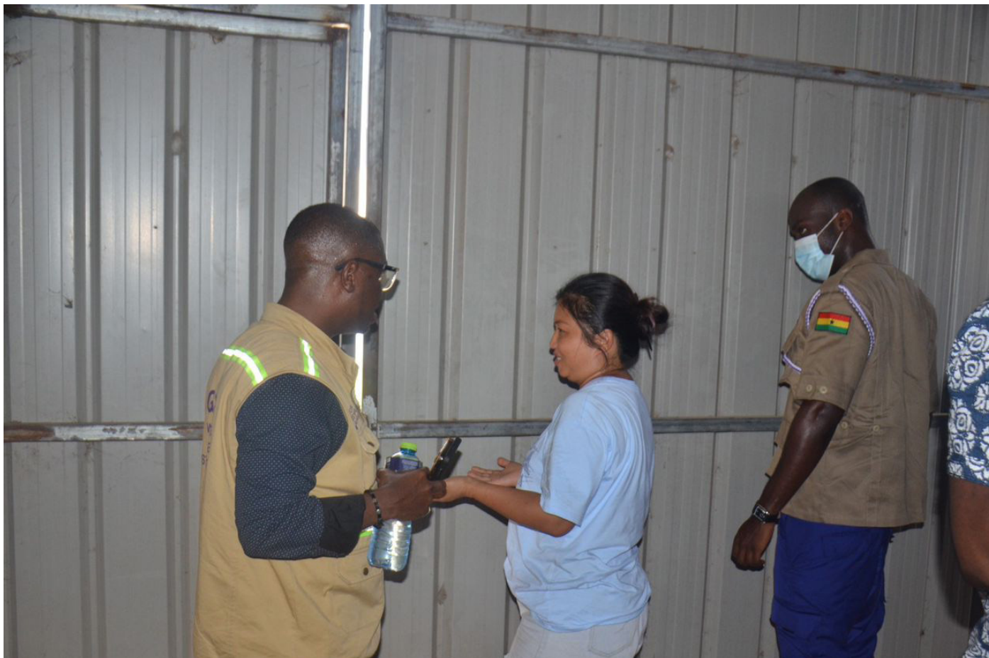
Mr. Anti engaging a factory worker on the sanctions of producing substandard products

of uncertified products and placed them under lock and key. The Authority is currently determining the next steps, which may include destroying items that cannot be safely repurposed.