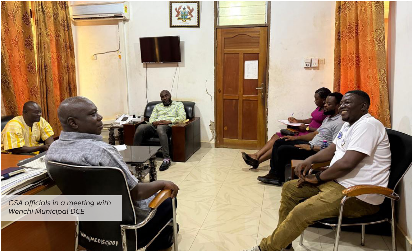
GSA officials in a meeting with Wenchi Municipal DCE