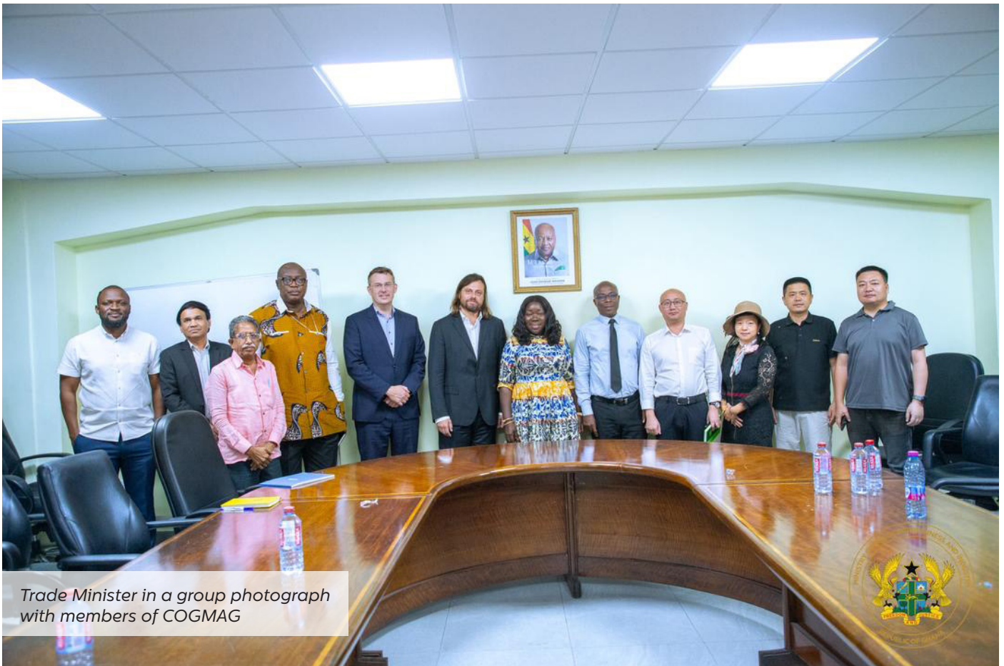
Trade Minister in a group photograph with members of COGMAG