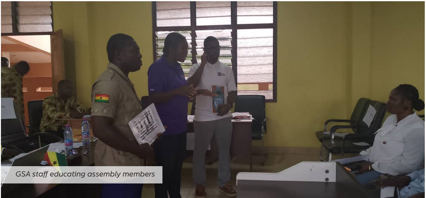
GSA staff educating assembly members