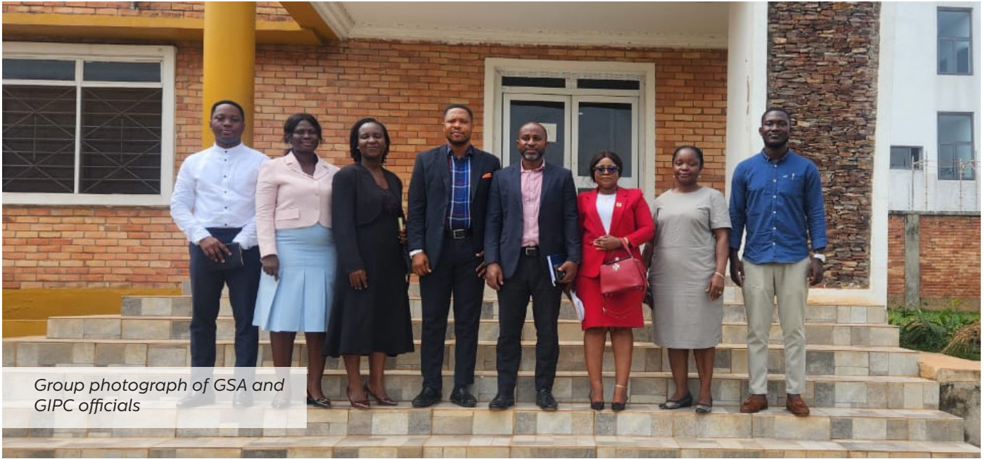
Group photograph of GSA and GIPC officials