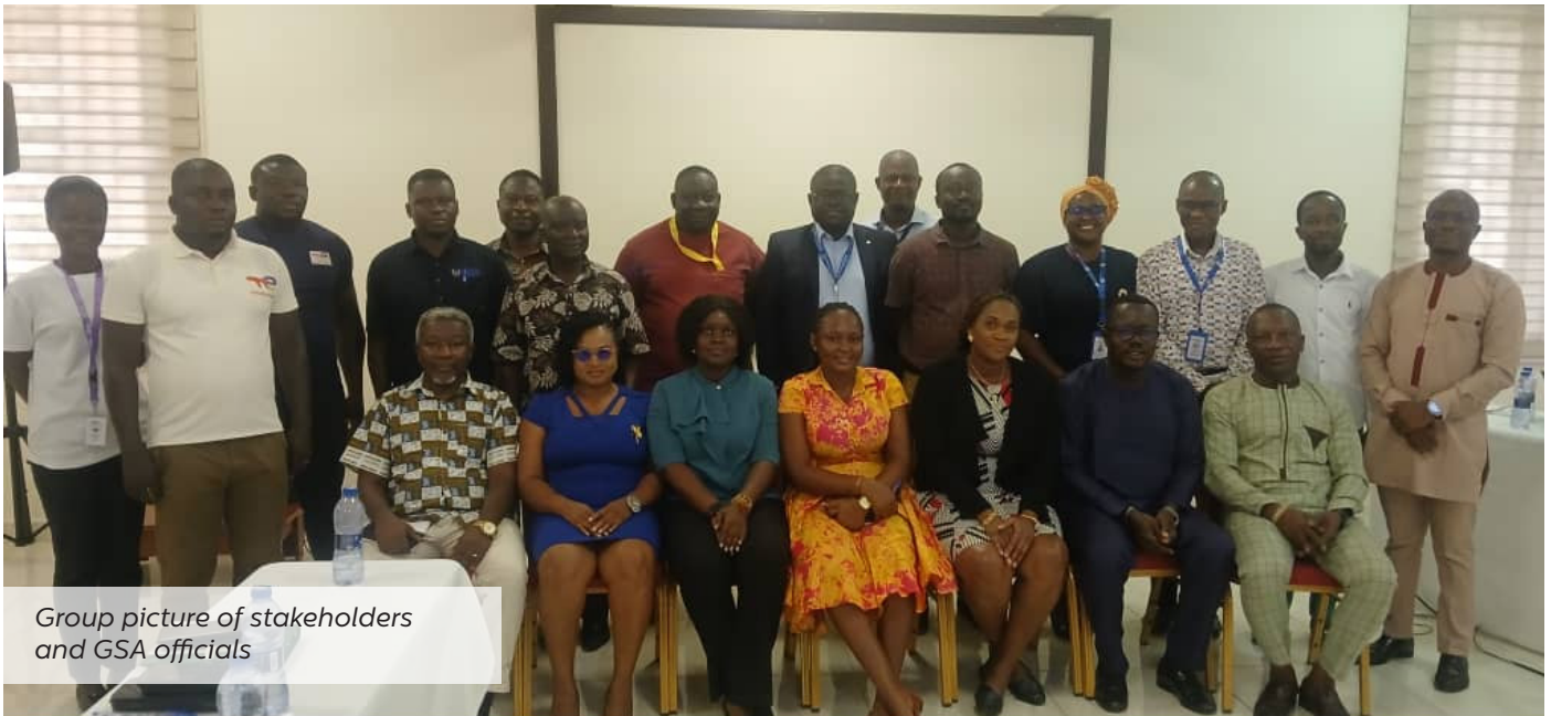
Group picture of stakeholders and GSA officials