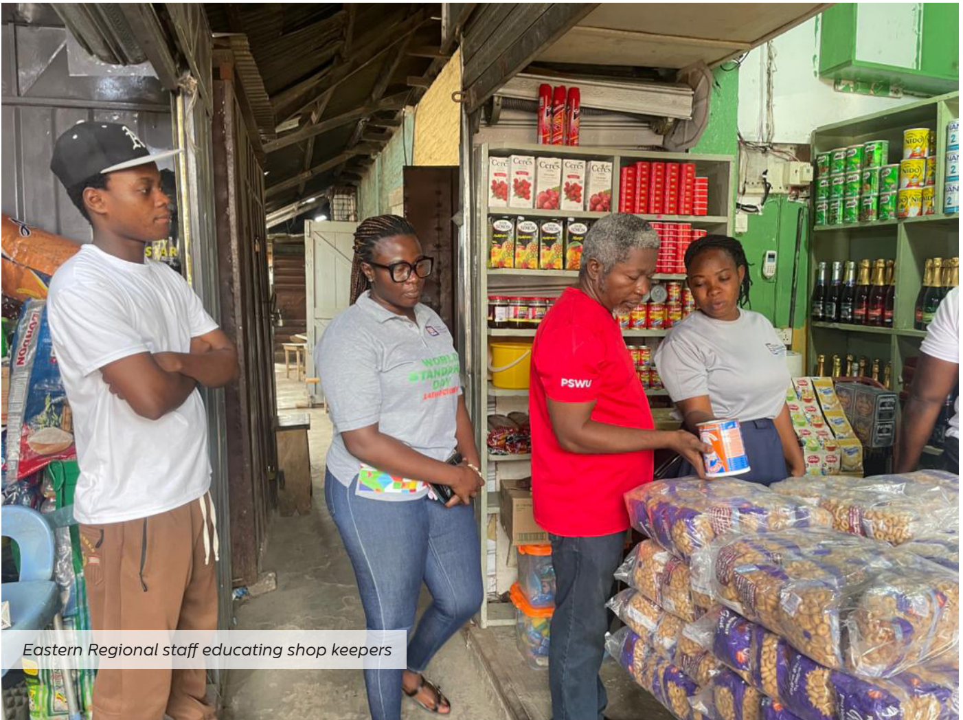
Eastern Regional staff educating shop keepers