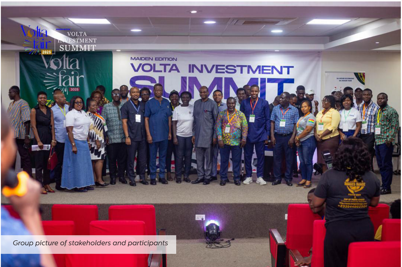
Group picture of stakeholders and participants