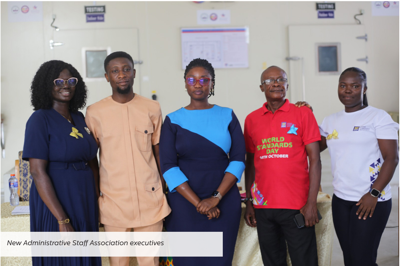
New Administrative Staff Association executives