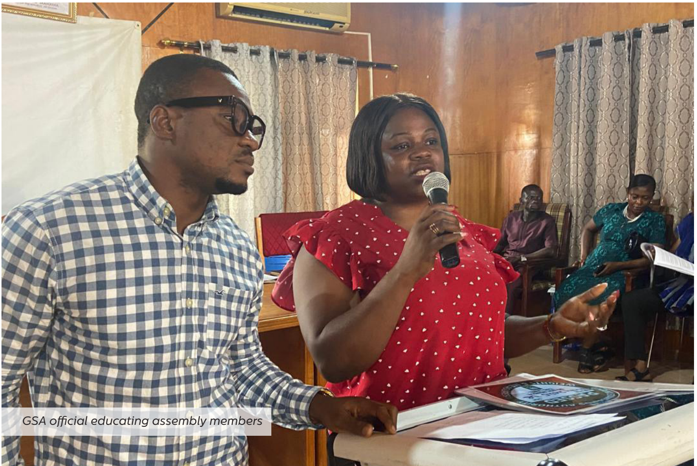
GSA official educating assembly members