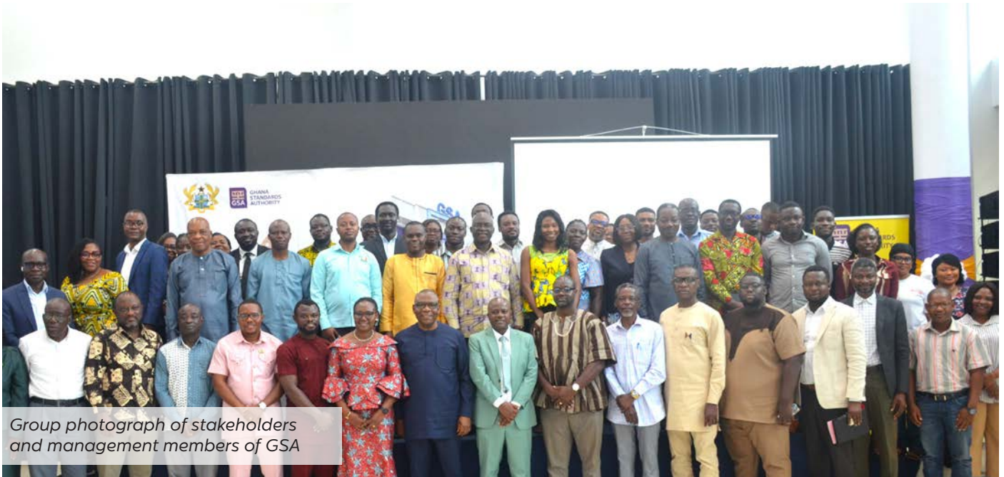
Group photograph of stakeholders and management members of GSA