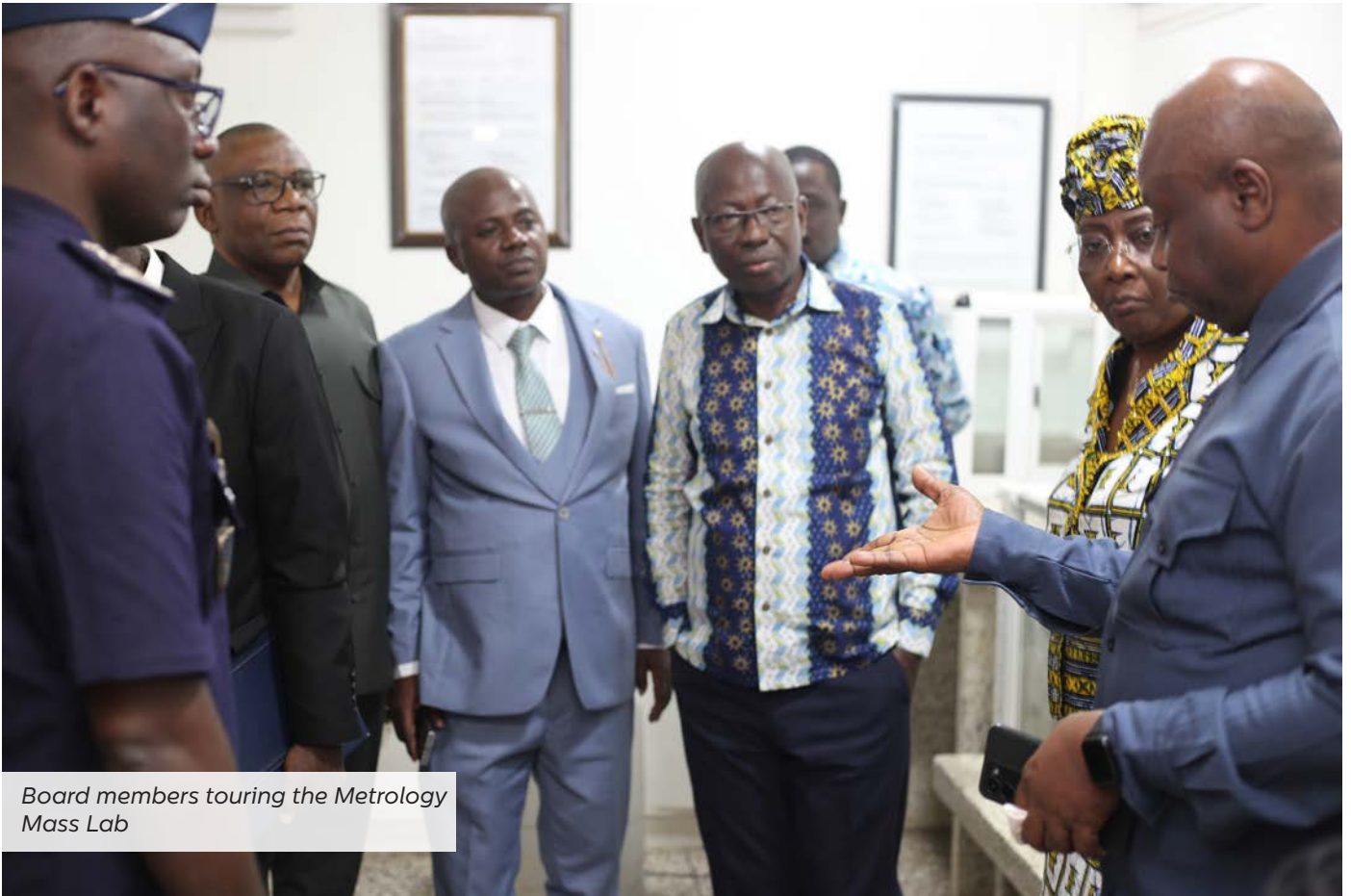
Board members touring the Metrology Mass Lab