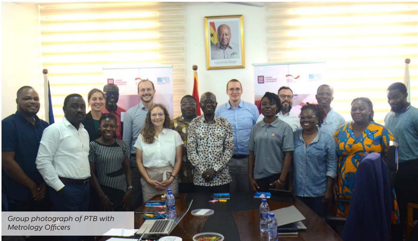
Group photograph of PTB with Metrology Officers