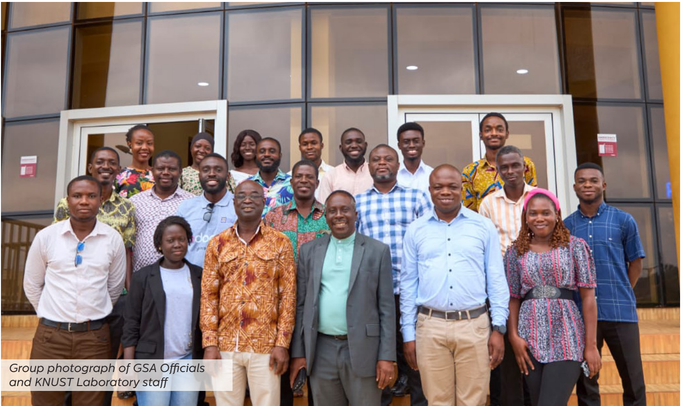
Group photograph of GSA Officials and KNUST Laboratory staff