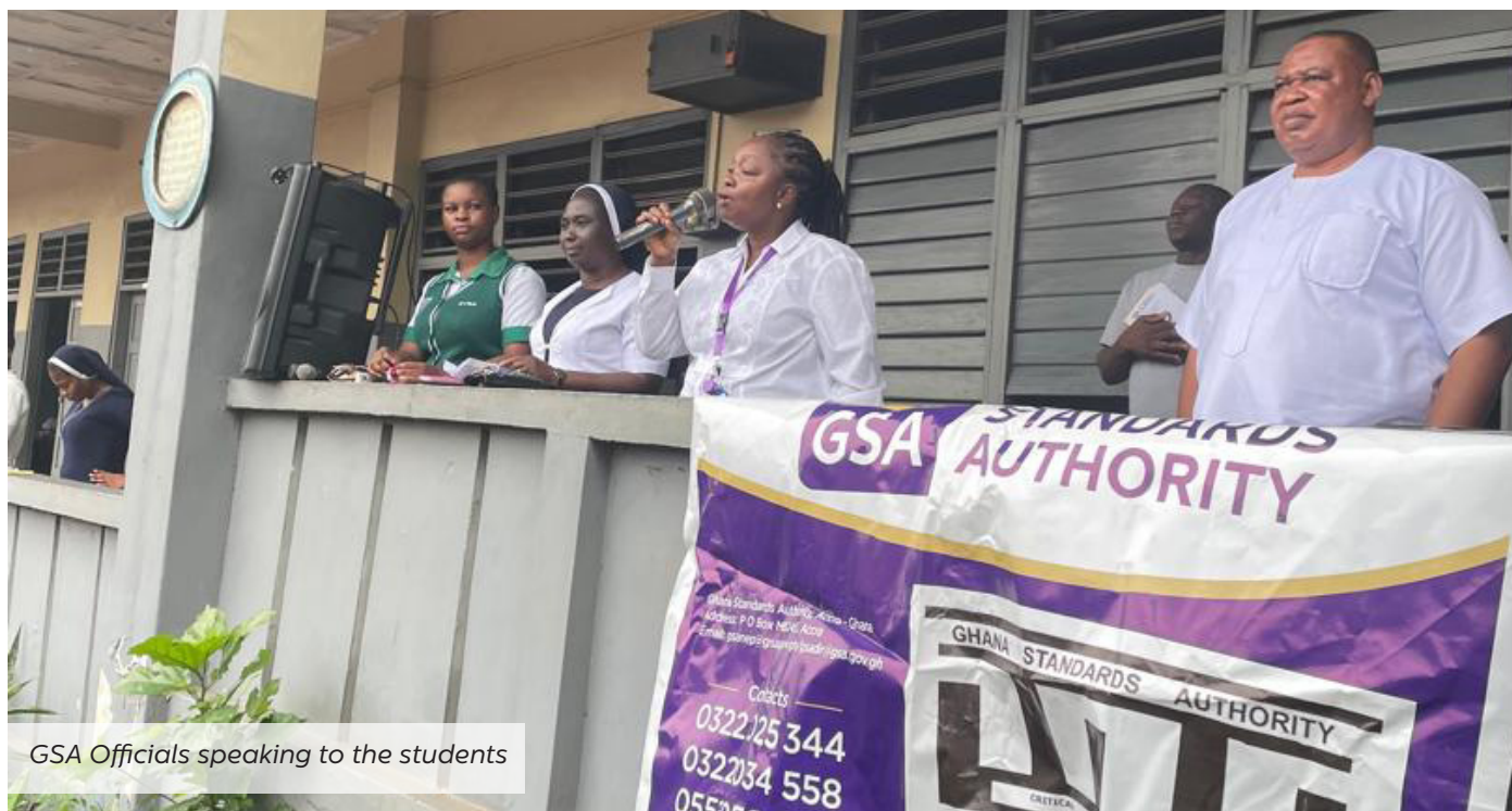
GSA Officials speaking to the students