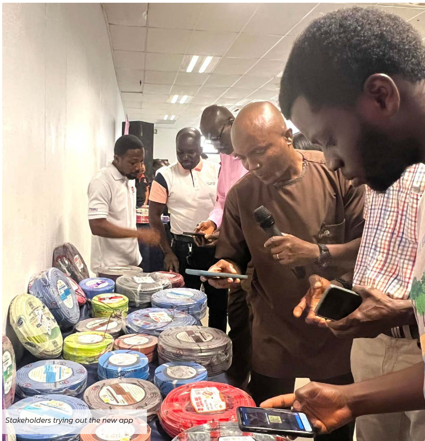
Stakeholders trying out the new app