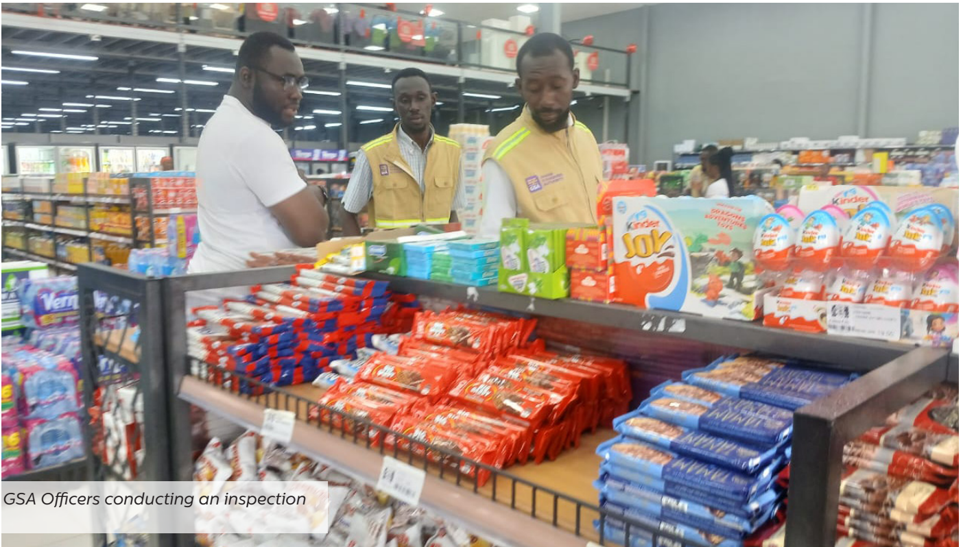
GSA Officers conducting an inspection