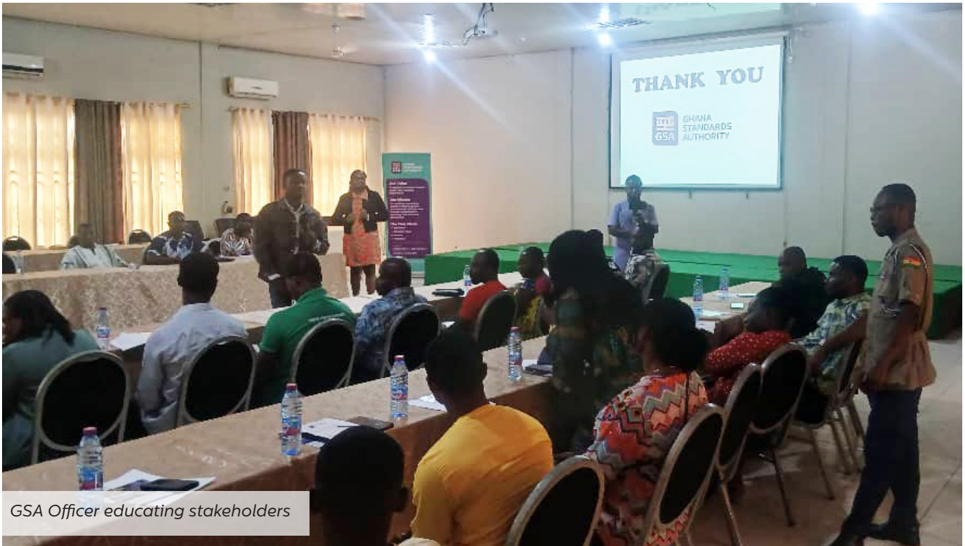
GSA Officer educating stakeholders