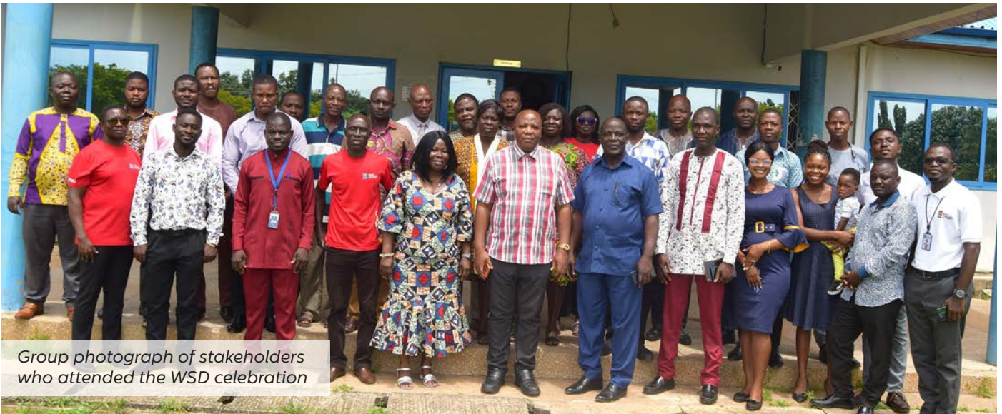
Group photograph of stakeholders who attended the WSD celebration