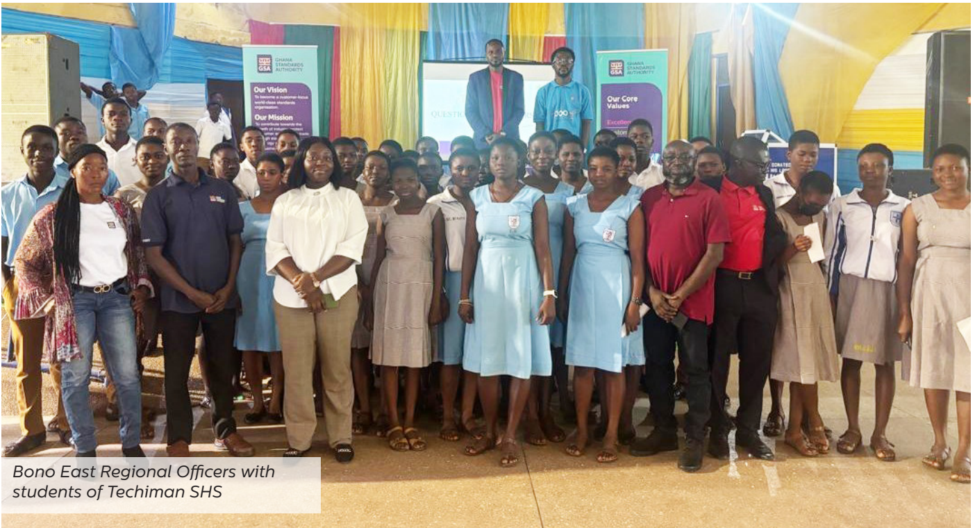
Bono East Regional Officers with students of Techiman SHS