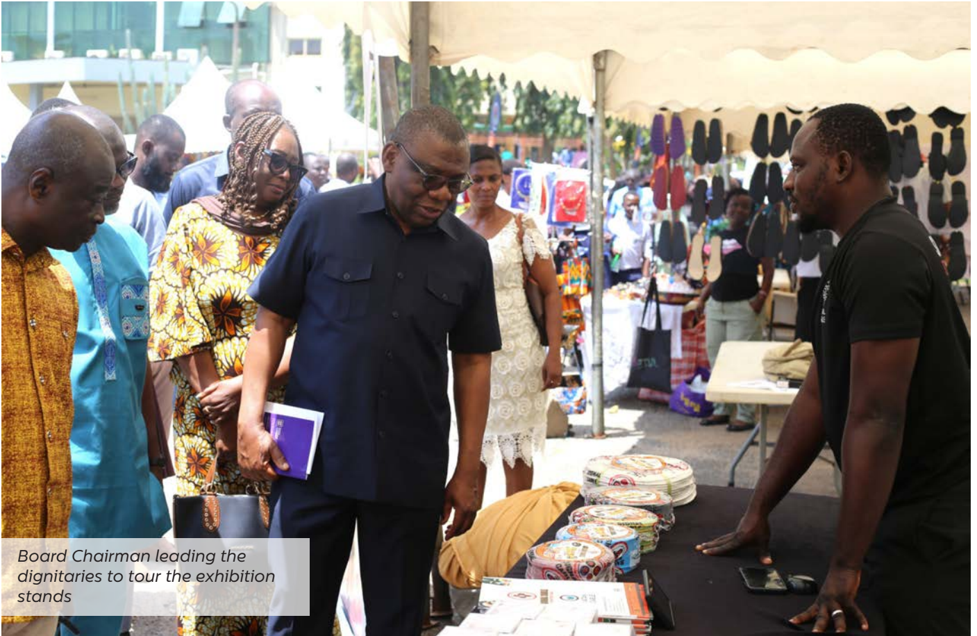
Board Chairman leading the dignitaries to tour the exhibition stands