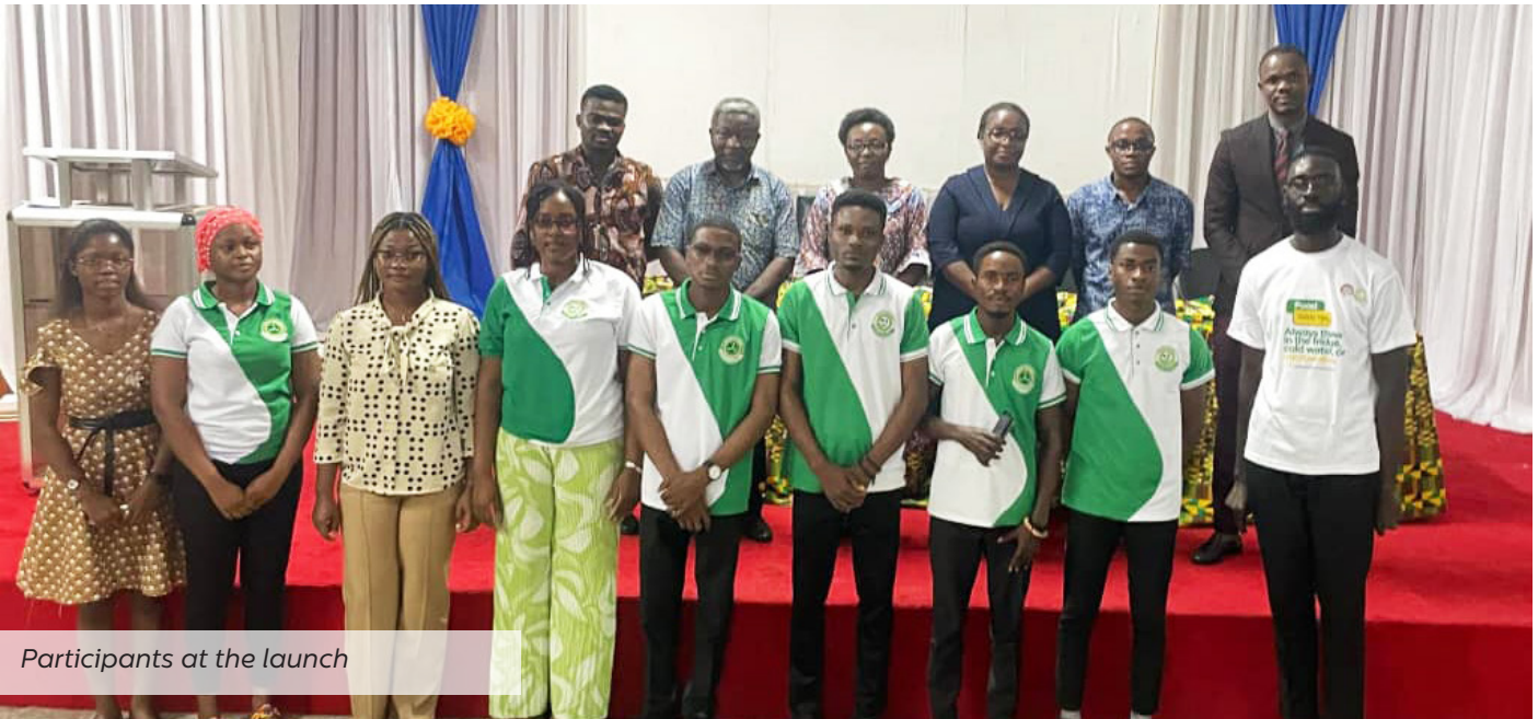
Participants at the launch