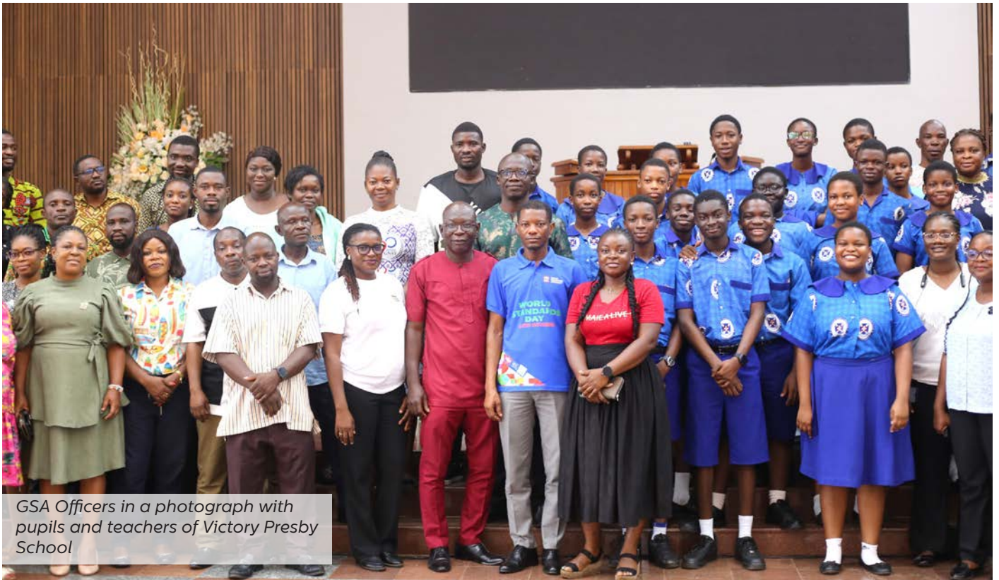
GSA Officers in a photograph with pupils and teachers of Victory Presby School