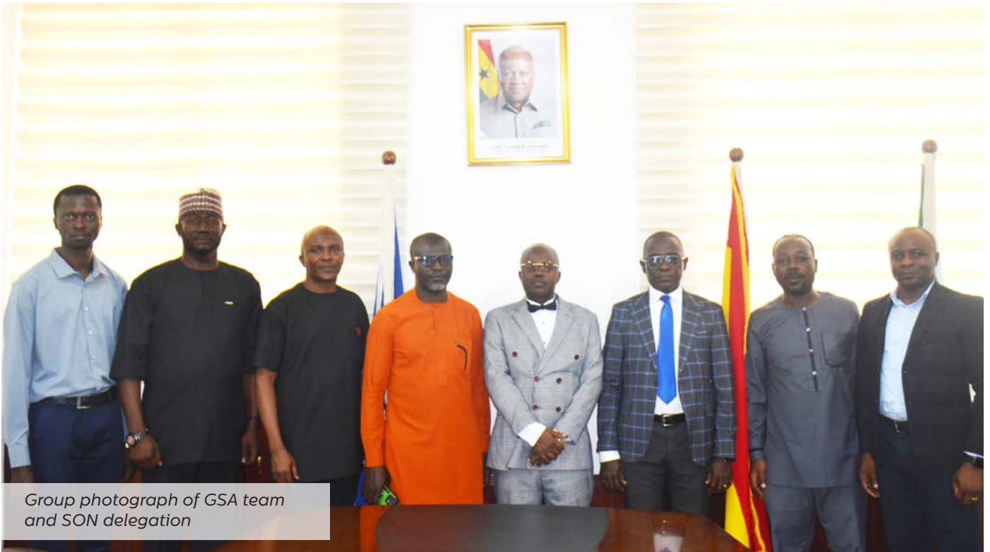
Group photograph of GSA team and SON delegation