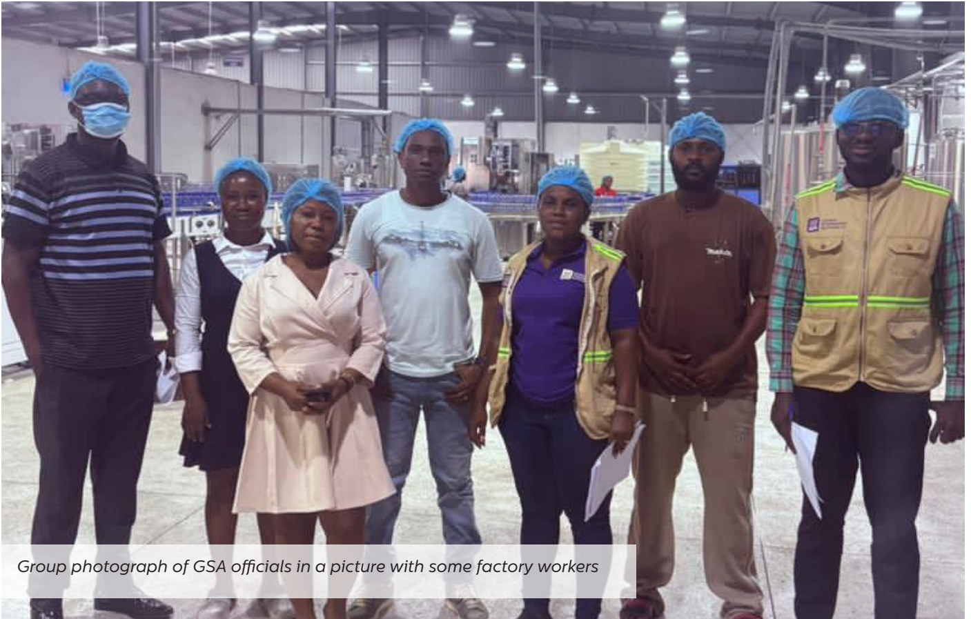
Group photograph of GSA officials in a picture with some factory workers