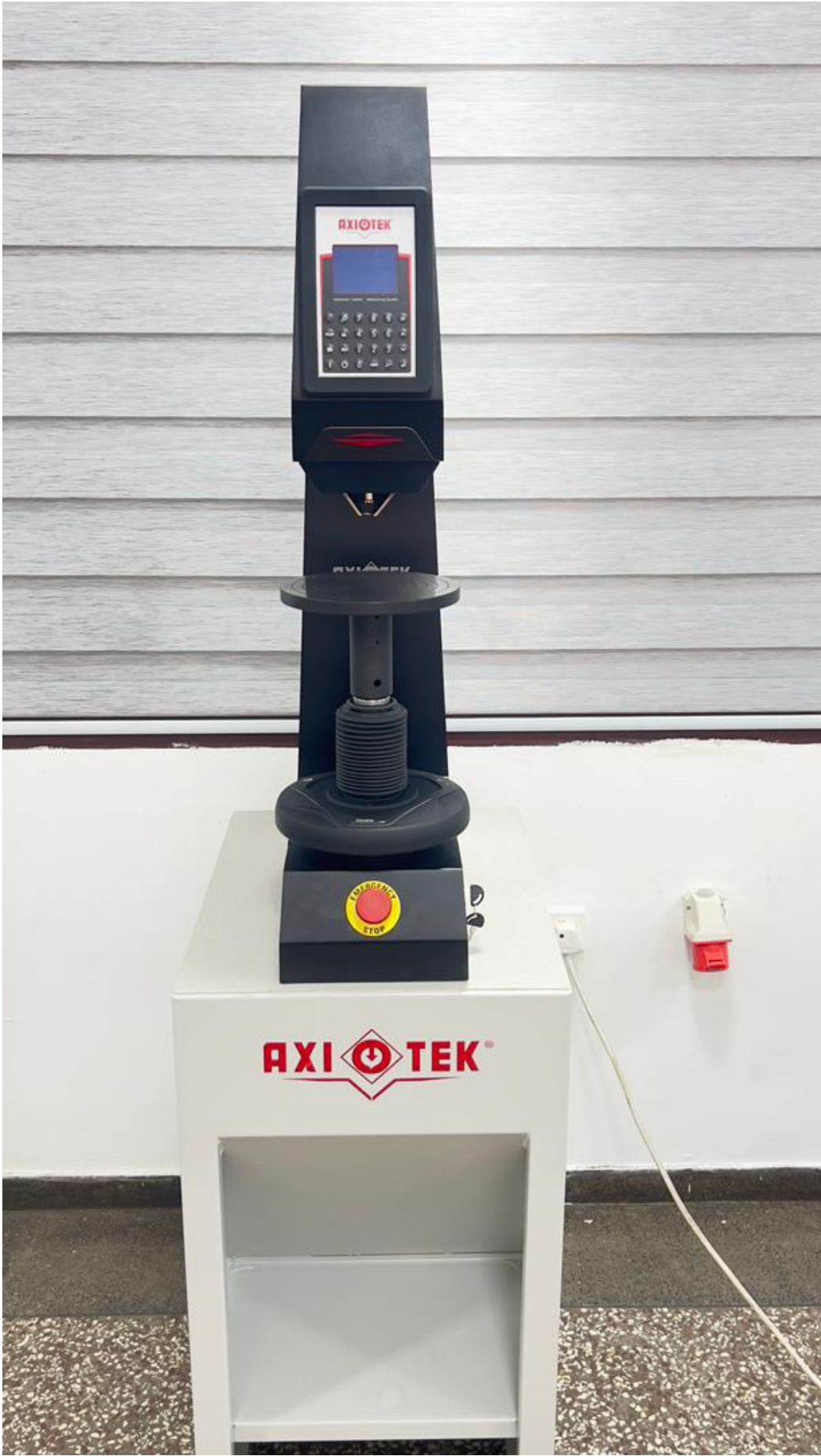
Axiotek Hardness Tester