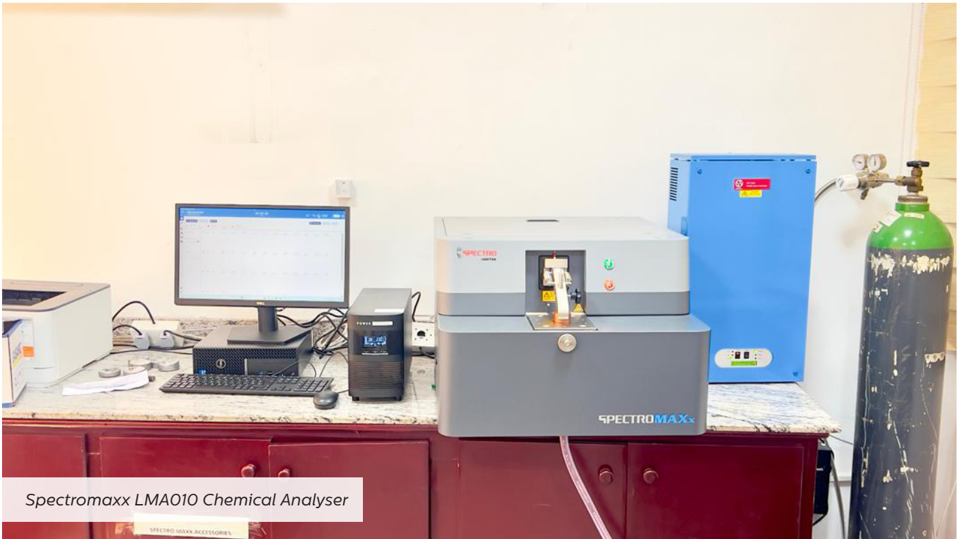
Spectromaxx LMA010 Chemical Analyser