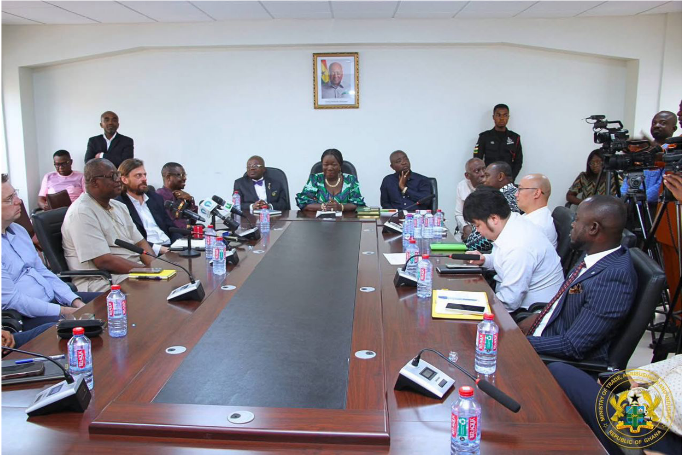
The MoTAI Minister and her Deputy in a meeting with COCMAG and GSA leadership

Ghana (COCMAG), to address emerging issues in the cement industry and ensure stability, fairness and compliance across the sector.