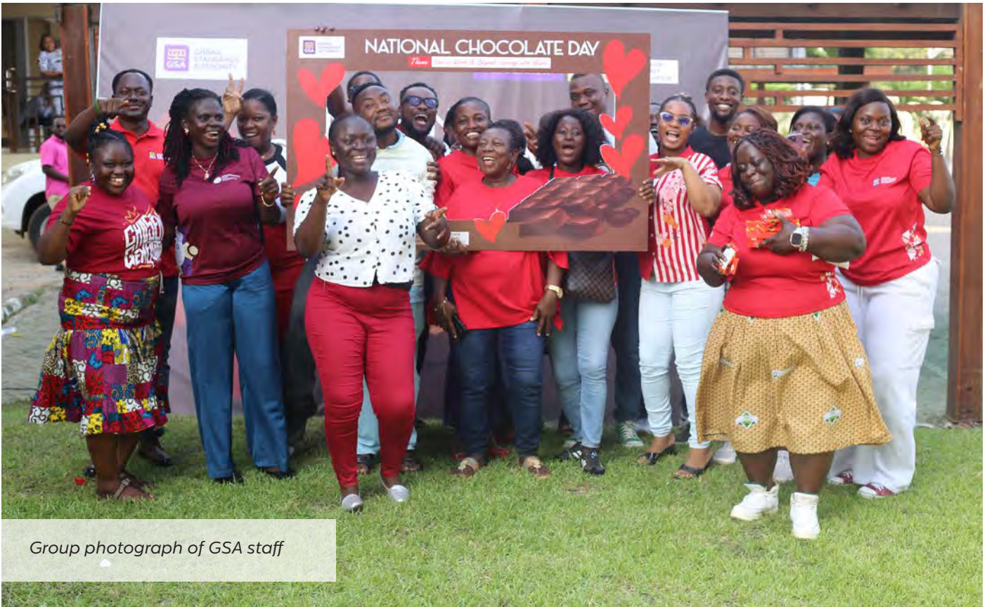
Group photograph of GSA staff