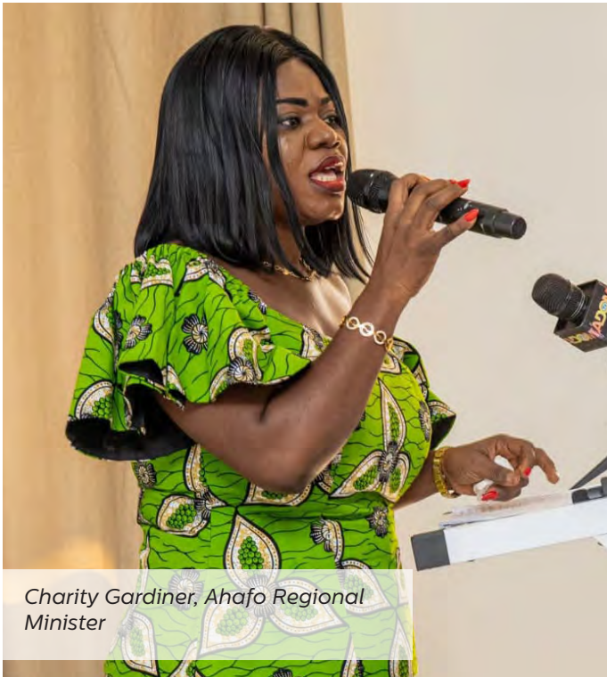
Charity Gardiner, Ahafo Regional Minister

our people. Ahafo is open for business, and the future is bright,” the Minister said.