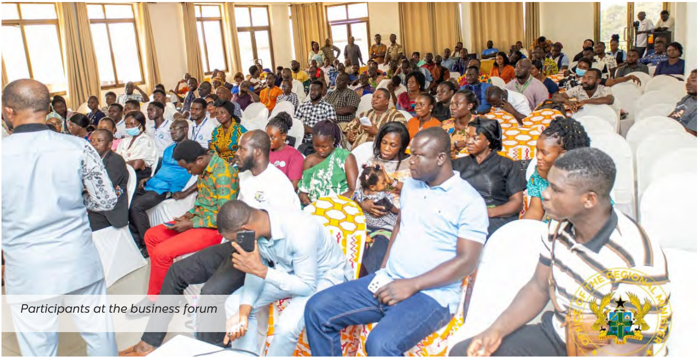
Participants at the business forum