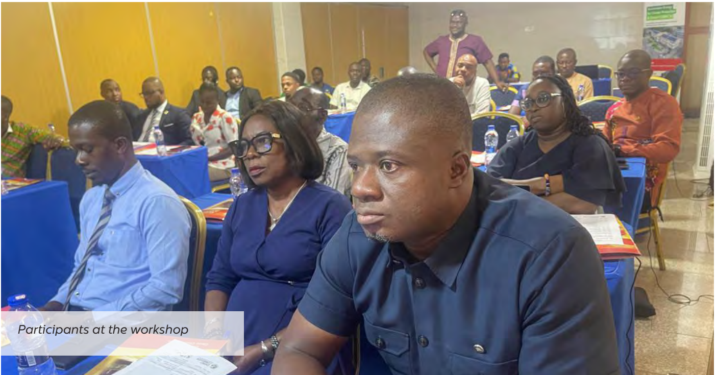
Participants at the workshop