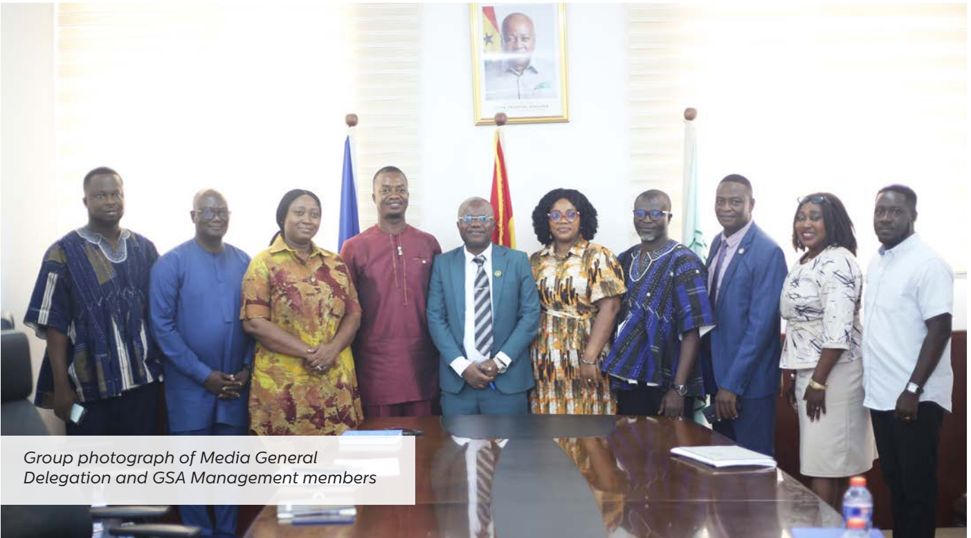
Group photograph of Media General Delegation and GSA Management members