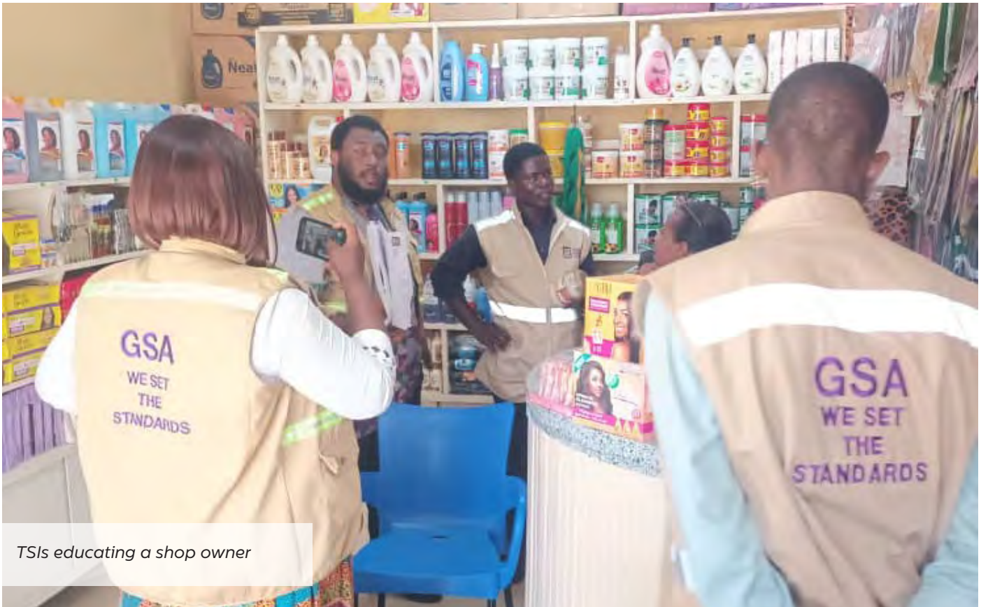
TSIs educating a shop owner