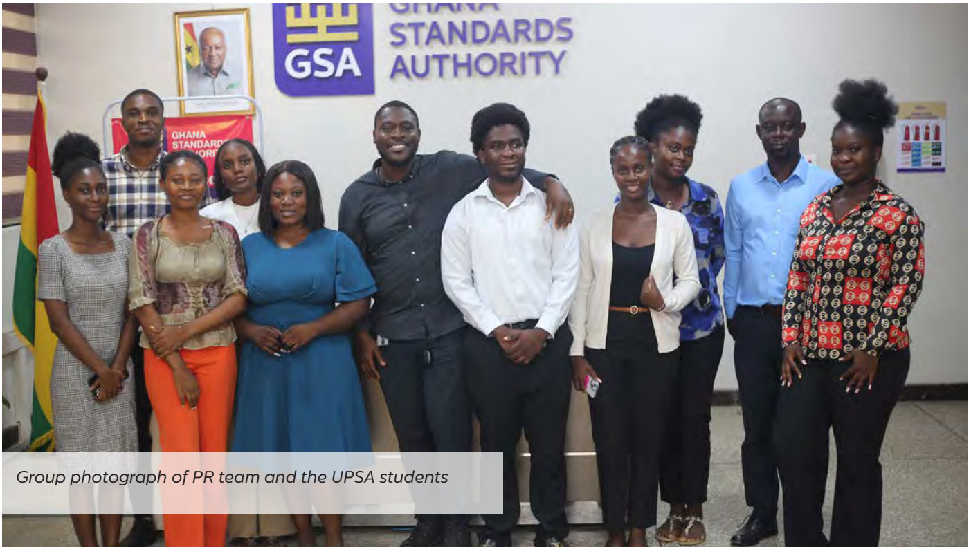
Group photograph of PR team and the UPSA students